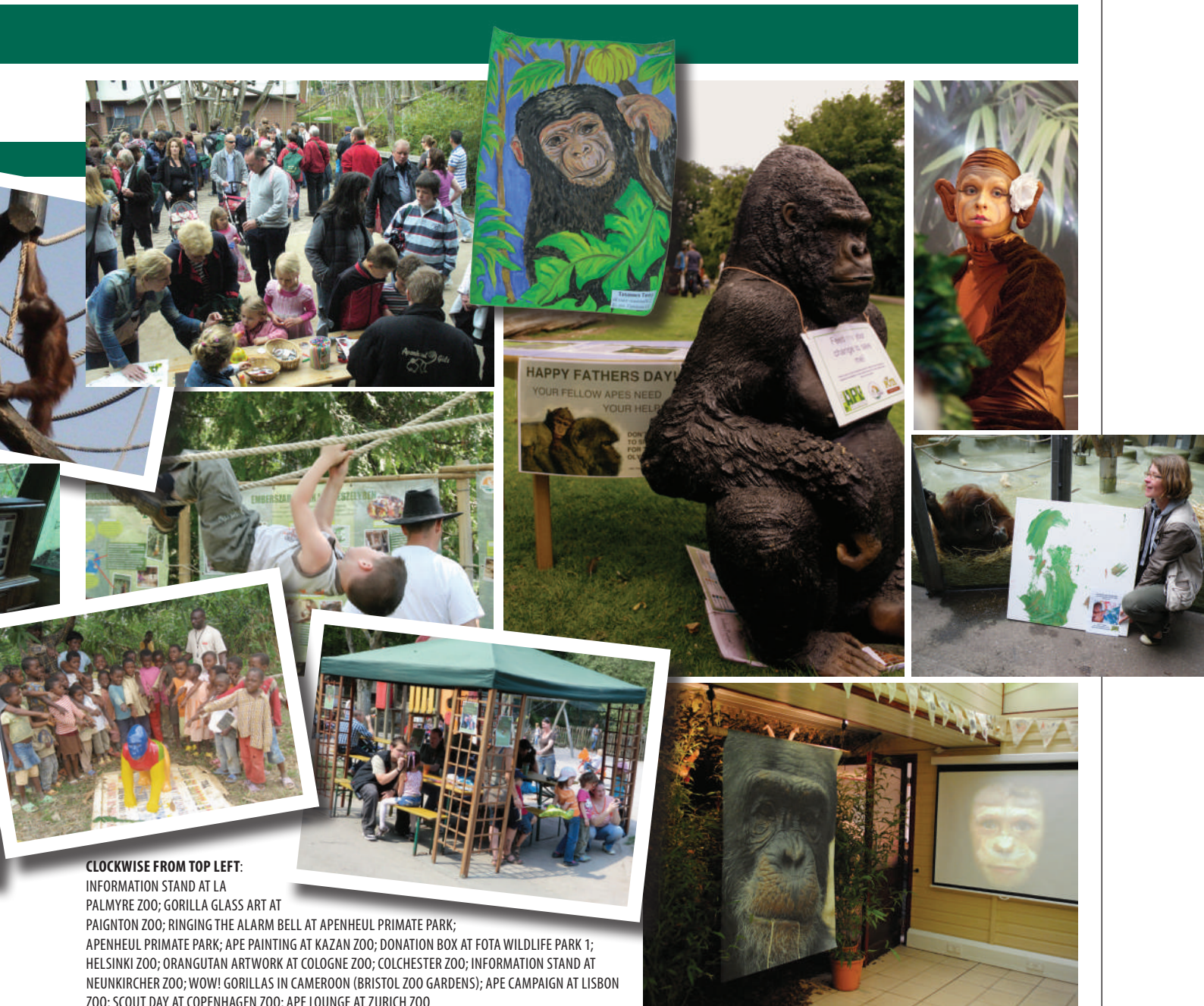
CLOCKWISE FROM TOP LEFT: INFORMATION STAND AT LA PALMYRE ZOO; GORILLA GLASS ART AT PAIGNTON ZOO; RINGING THE ALARM BELL AT APENHEUL PRIMATE PARK; APENHEUL PRIMATE PARK; APE PAINTING AT KAZAN ZOO; DONATION BOX AT FOTA WILDLIFE PARK 1; HELSINKI ZOO; ORANGUTAN ARTWORK AT COLOGNE ZOO; COLCHESTER ZOO; INFORMATION STAND AT NEUNKIRCHER ZOO; WOW! GORILLAS IN CAMEROON (BRISTOL ZOO GARDENS); APE CAMPAIGN AT LISBON ZOO; SCOUT DAY AT COPENHAGEN ZOO; APE LOUNGE AT ZURICH ZOO

House. Visitors were invited to make themselves comfortable on an old sofa and, by activating a press button, to listen to the voices of eight different species of gibbon. For a small donation visitors were able to download a ringtone of the pileated gibbon's or the siamang's cry.