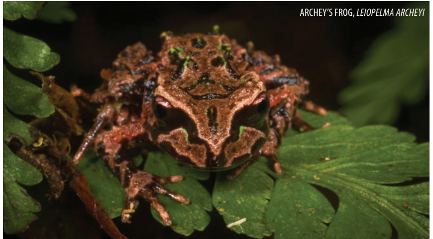
ARCHEY'S FROG, LEIOPELEMA ARCHEYI

The Amphibian Ark has led ex situ initiatives focusing on species that cannot be safeguarded in nature. Thanks to fantastic support from zoos, 100 amphibian species are now on board the AArk, and the amphibian community is extremely grateful for the role that zoos have played. However, there are at least 800 more species to go that require ex situ interventions – are we up for the challenge?