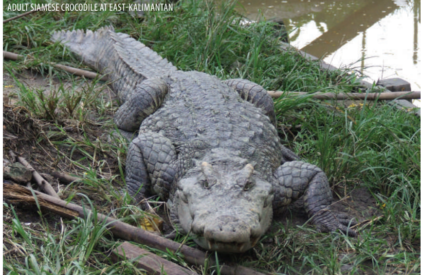
ADULT SIAMESE CROCODILE AT EAST-KALIMANTAN

of Danau Mesangat, a rare example of sympatric occurrence of these two crocodile species.