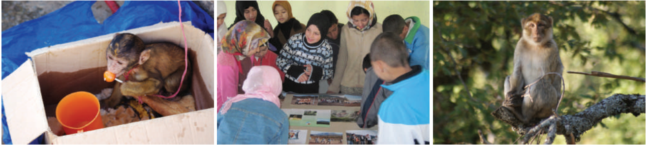
FROM LEFT: INFANT MACAQUE CAPTURED BY LOCAL INDIVIDUAL AND RETURNED TO NATAL GROUP BY BMCRIF; BMCRIF EDUCATION AND AWARENESS INTERACTIVE LESSONS WITH VILLAGE CHILDREN; YOUNG MALE IN BOUHACHEM FOREST NORTHERN MOROCCO