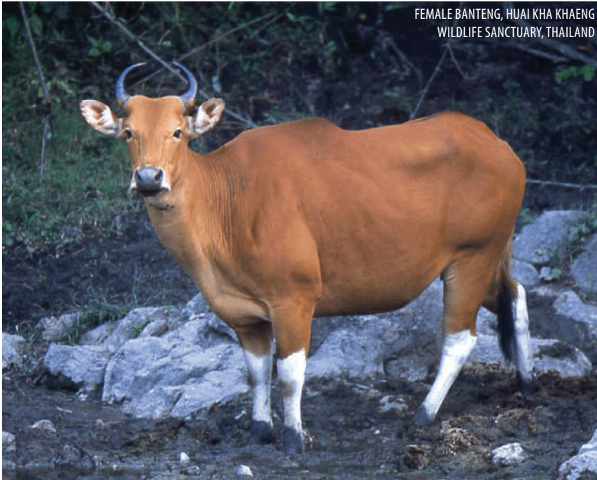
FEMALE BANTENG, HUAI KHA KHAENG WILDLIFE SANCTUARY, THAILAND