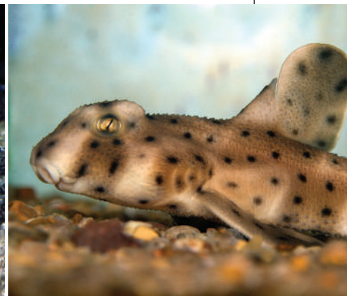
LEFT TO RIGHT: YOUNG SHORT-TAIL NURSE SHARKS; NEWLY-BORN SHORT-TAIL NURSE SHARK; CALIFORNIA HORN SHARK; SCREW-SHAPED EGG CAPSULE OF A CALIFORNIA HORN SHARK; NEWLY-BORN CALIFORNIA HORN SHARK

and subsequently bred themselves, providing very useful adult maturation knowledge that will form the basis of further articles.