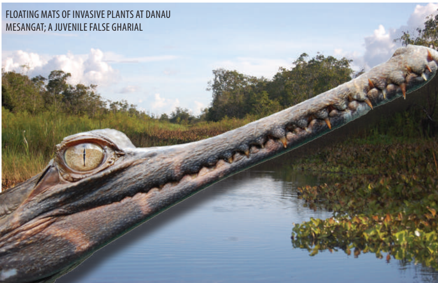
FLOATING MATS OF INVASIVE PLANTS AT DANAU MESANGAT; A JUVENILE FALSE GHARIAL